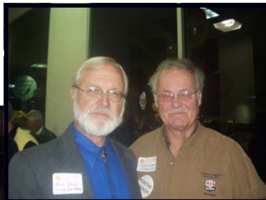
Potential Members ?