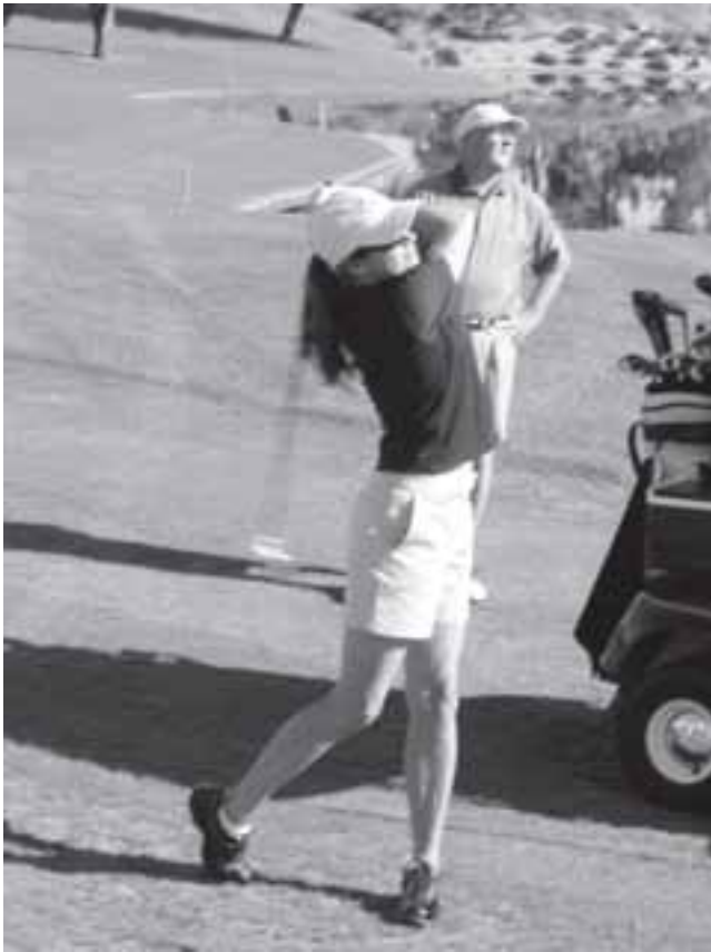
Mary Bono's got great follow-through