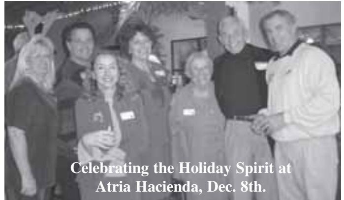
Celebrating the Holiday Spirit at Atria Hacienda, Dec. 8th.